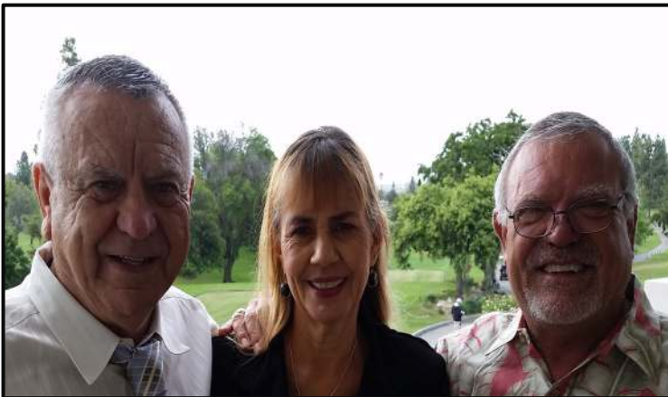
Joe La Fountain 2004 Hall of Fame Inductee